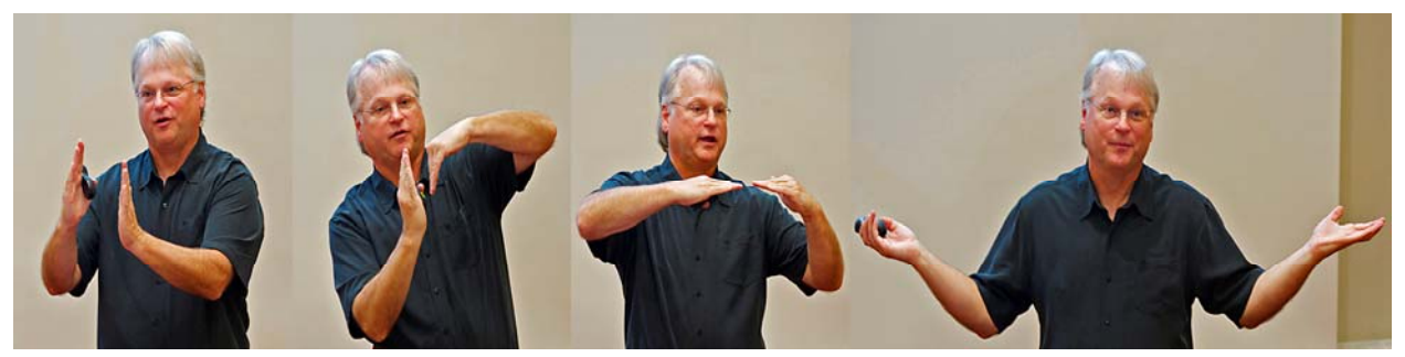
Engaging, educating, interactive and dynamic discussions

to convey with confidence industry trends, perspectives, and directions about data infrastructure technologies, techniques, and management best practices.